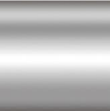
SST - STAINLESS STEEL