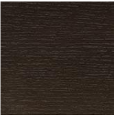
MWE - WENGE'