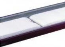
Extra set 2 chilling packs