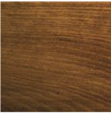
MNO - WALNUT