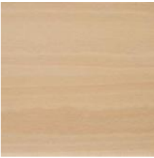
MNL - NATURAL