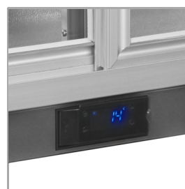
Protective thermostat cover