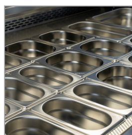
Designed for GN1/1 pans, not supplied